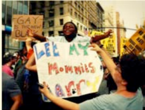
2 PEOPLE ARE DISCUSSING THIS